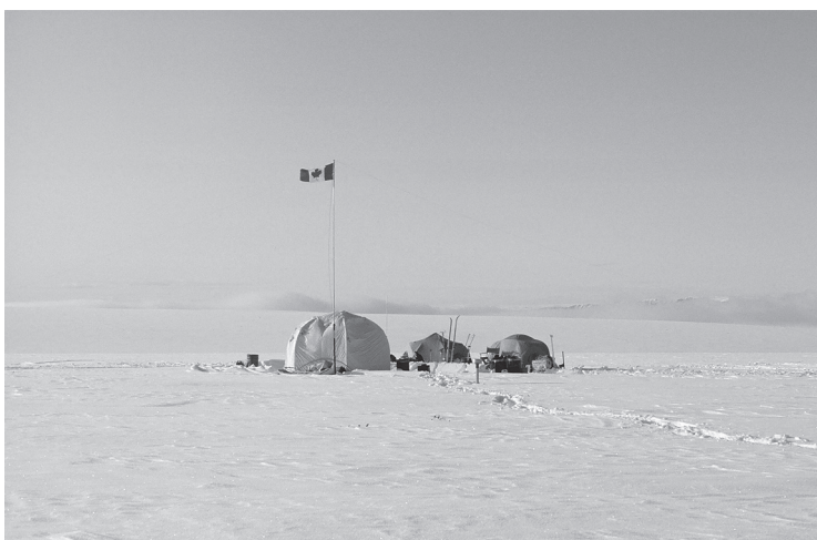
FIGURE 2. Camp at the edge of the ice cap, early June 1982, with a full snow cover.

the snow. These numbers told us how much accumulation there had been on the ice cap through the previous autumn and winter.