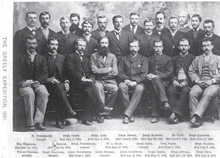
FIGURE 3. Members of the Lady Franklin Bay expedition. Greely is sitting in the bottom row, fourth from the left.

explored large parts of the coasts of both Greenland and Ellesmere Island.