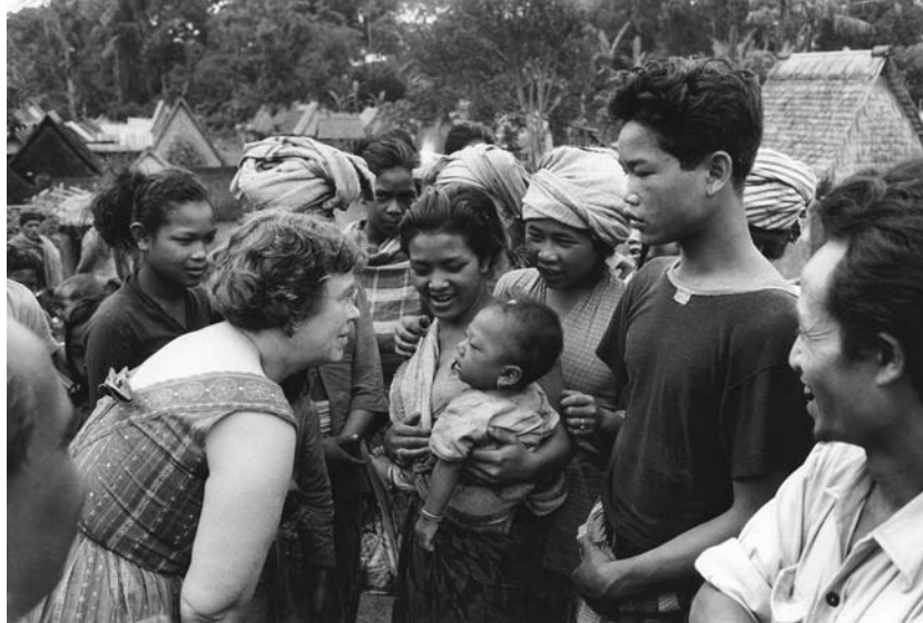
Figure I.3 Frequently reproduced image of Mead peering at a Balinese baby, 1957.

that she has achieved a particularly distinct role in American culture, that of a representative figure. As such over the course of her lifetime, as well as after her death, images of her have circulated in popular culture and scholarly arenas that function as referents to Mead the person and also to various sets of ideas that she has come to represent to different publics and different viewers.