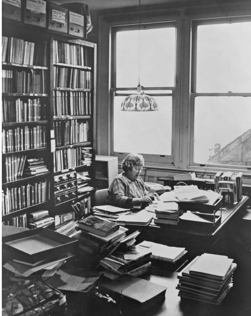
Figure I.4 Mead's turret office at the American Museum of Natural History overlooked Columbus Avenue. Having had to hike up to it, journalists frequently commented on the office's remote location and exotic decor. (Neg. No. 338668, Courtesy of the Department of Library Services, American Museum of Natural History, New York City)