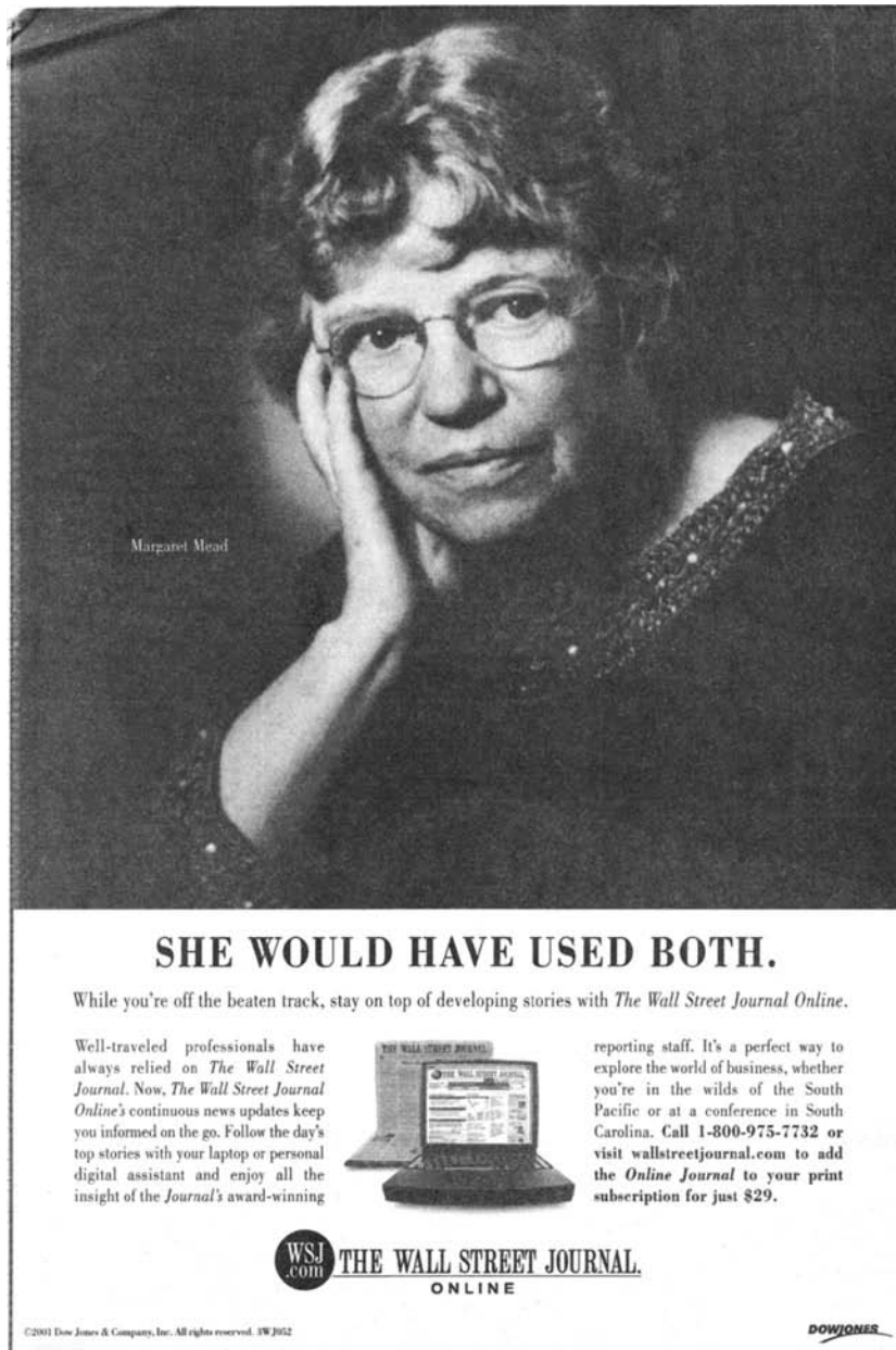
Figure I.2 Wall Street Journal ad, 2001.