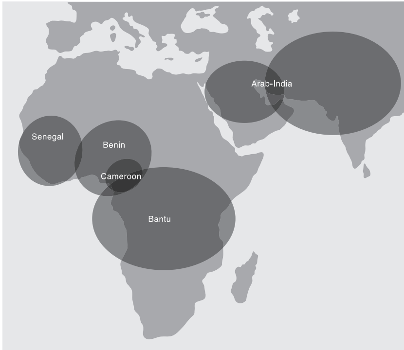
Figure 1.1 Sickle cell haplotype map based on where each mutation was theorized to have emerged. The beta hemoglobin gene that contains the sickle mutation evolved independently in different regions of the world. Although the mutation is the same, the chromosomal background, or sequence on the chromosome that most people from these named populations share, is older than the specific mutation that codes for sickle cell.

fetal hemoglobin that adults with sickle cell produce at varying levels. Environmental, dietary, and social contributors have yet to be taken seriously in these studies.