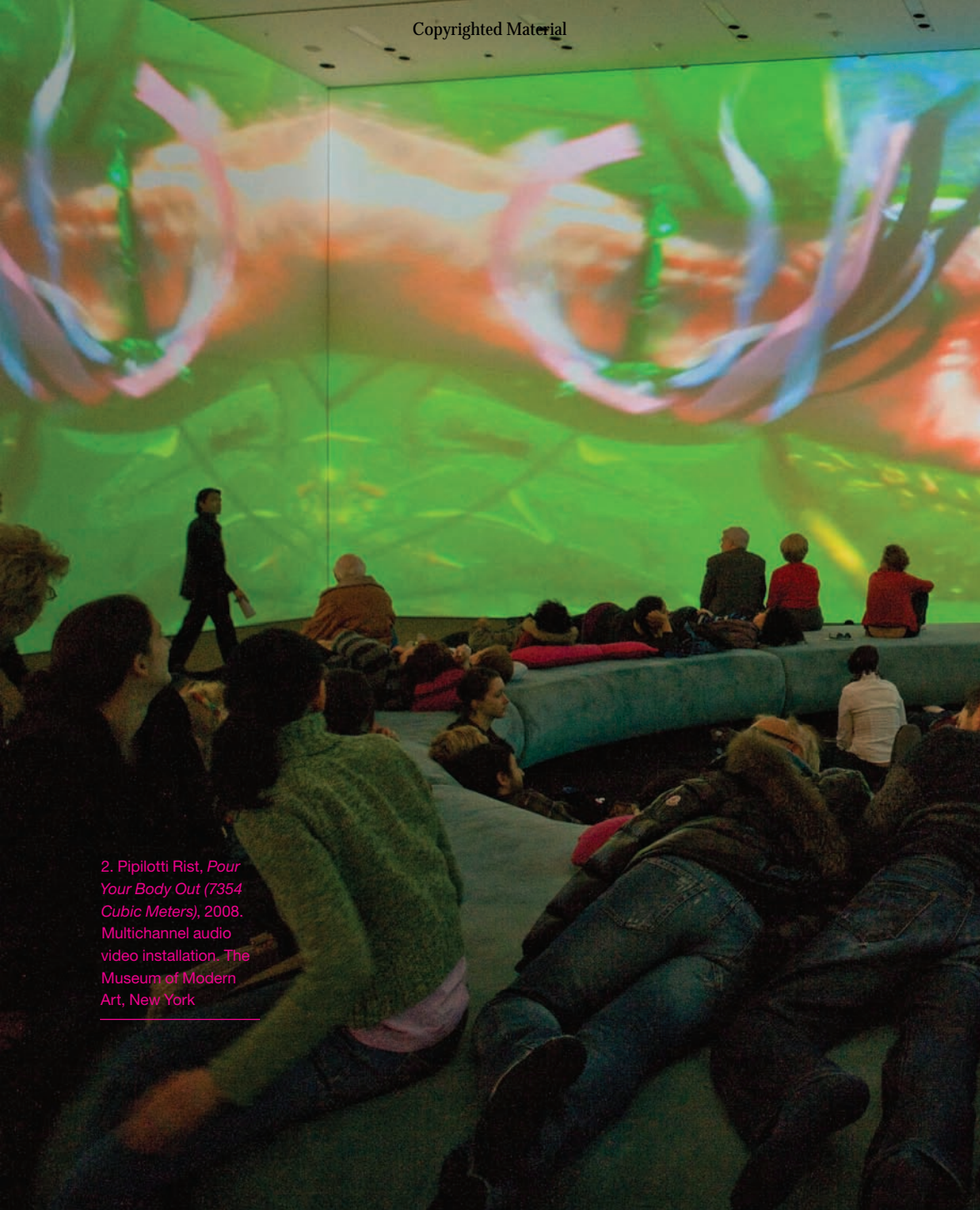
2. Pipilotti Rist, Pour Your Body Out (7354 Cubic Meters) , 2008. Multichannel audio video installation. The Museum of Modern Art, New York