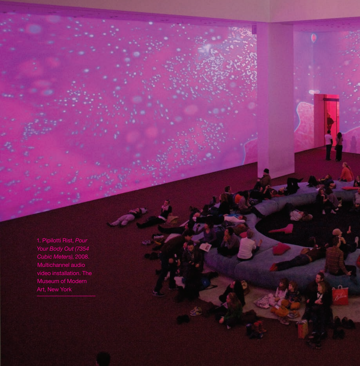
1. Pipilotti Rist, Pour Your Body Out (7354 Cubic Meters) , 2008. Multichannel audio video installation. The Museum of Modern Art, New York