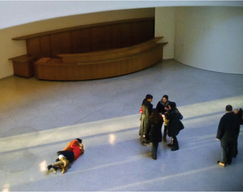
3. Tino Sehgal, The Kiss , performed in 2009. Guggenheim Museum, New York