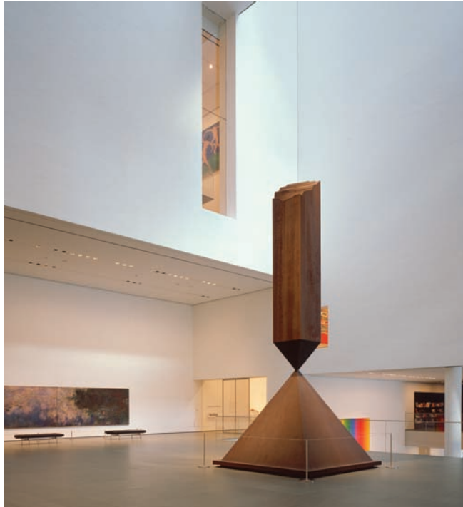
5. Barnett Newman, Broken Obelisk , 1963–69. MoMA Gallery Second Floor, Public Space, winter 2005. © 2011 The Barnett Newman Foundation, New York/ Artists Rights Society (ARS), New York

an expected but no less disappointing confirmation of MoMA's historic commitment to distinguishing (and benefiting from the contrast) between the progressive architecture displayed in the museum and the unspeakably banal architecture of the museum.