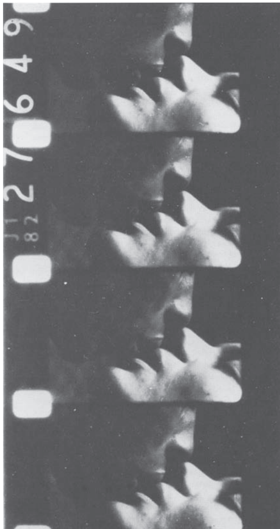
4. Andy Warhol, Kiss . Still. © 2011 The Andy Warhol Foundation for the Visual Arts, Inc./ Artists Rights Society (ARS), New York