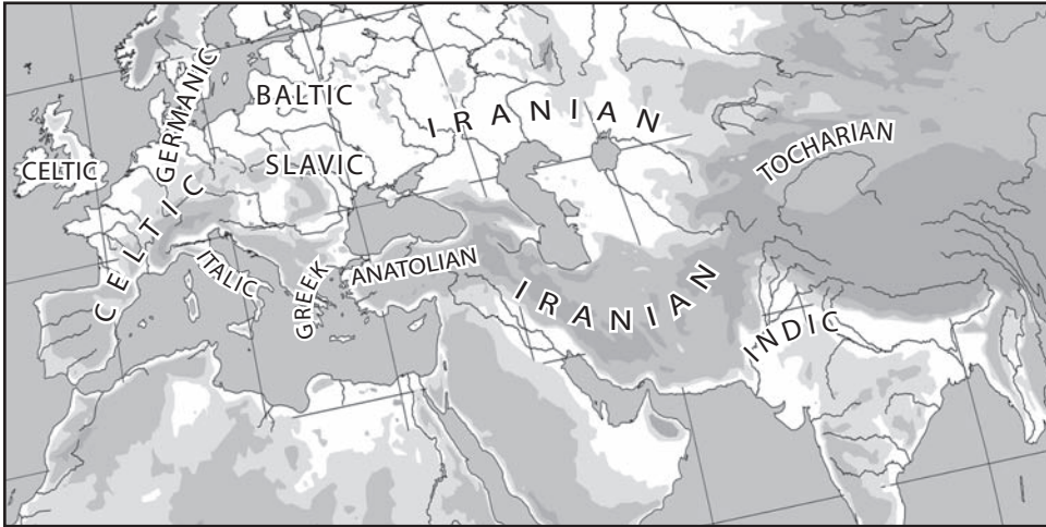
Figure 1.2 The approximate geographic locations of the major Indo-European branches at about 400 BCE.

Linguists have reconstructed the sounds of more than fifteen hundred Proto-Indo-European roots. 12 The reconstructions vary in reliability, because they depend on the surviving linguistic evidence. On the other hand, archeological excavations have revealed inscriptions in Hittite, Mycenaean Greek, and archaic German that contained words, never seen before, displaying precisely the sounds previously reconstructed by comparative linguists. That linguists accurately predicted the sounds and letters later found in ancient inscriptions confirms that their reconstructions are not entirely theoretical. If we cannot regard reconstructed Proto-Indo-European as literally “real,” it is at least a close approximation of a prehistoric reality.