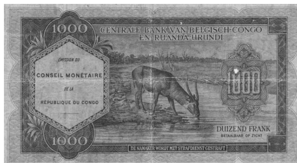
Figure 2.6. A bank note printed by a colonial currency board. The colonial central bank for the Congo, Rwanda, and Urundi (now Burundi) used to exchange local francs for Belgian francs and vice versa. After independence (mid 1960), Congo’s currency board ( conseil monétaire ) initially just printed a reference to the Republic of the Congo on the old colonial notes. The Dutch at the bottom means “one thousand francs payable at sight” (“duizend frank betaalbaar op zicht”) and “the counterfeiter is punished by forced labor” (“de namaker wordt met strafdienst gestraft”).

The roots of this system were in the colonial period, where a local institution issued a local currency but was not allowed to pursue an active monetary policy; rather, it just exchanged, say, Belgian francs into Congolese francs or vice versa, one to one, and issued no extra Congolese francs via any other means (figure 2.6). In a modern currency board, the idea is similarly that (i) the board can issue local currency only if agents freely want to obtain it in exchange for hard currency, and (ii) the board has to take back local currency in exchange for hard currency if investors prefer so. From rule (i), all local currency should be fully backed by hard currency, so rule (ii) should pose no problems. Monetary policy is to be passive, just determined by the economy’s demands—a libertarian’s wet dream. It should also be fully immune to speculative attacks.