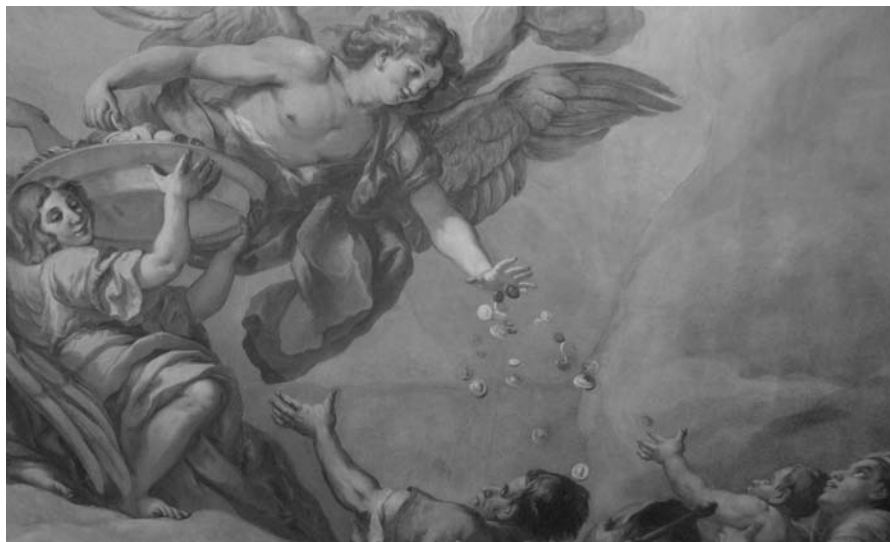
Figure 2.1. Baroque open-market policies. (Fresco, probably by J. M. Rottmayr (1656–1730), in the cupola of the Karlskirche, Vienna.)