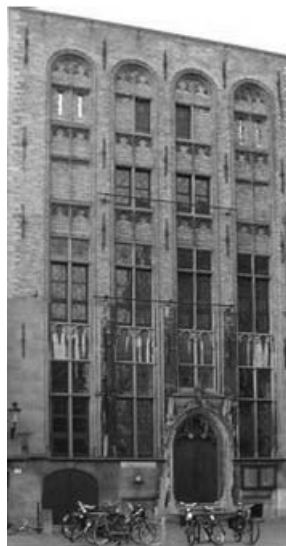
Figure 2.4. Bourse, börse, borsa, beurs, bolsa, exchange.

In Bruges, the main trading center in the Low Countries (Benelux) until the late 1400s, exchange transactions and discounting and trading of bills took place on a little square in front of two inns, Ter Beurse (picture) and De Oude Beurs, named after the innkeeper, Van der Beurze (beurs means purse)—hence the continental words börse, beurs, bourse, bolsa, borsa, and so on, for organized capital markets. Bruges's Beurs was rather informal by current standards, but it drew up a rulebook in 1309, including the opening and closing bell still found in the NYSE. The first truly organized exchange in the West, with fixed opening hours, rules, members, and such, was the Beurs of Antwerp in 1531; commercial paper and T-bills were traded in the afternoon while commodity forwards and options were traded in the morning. One of the Beurs's members was Lord Thomas Gresham—yes, the Gresham of good and bad money—who soon convinced Elizabeth I to build a similar bursa in London, 1565. (She later changed its name, by decree, into Royal Exchange. Do read Gresham's CV on Wikipedia, incidentally: the SEC would jail him, nowadays.) Rotterdam and Amsterdam followed in 1595 and 1613, respectively. Amsterdam's addition was the anonymous joint-stock company and the corporate bond (the Dutch United East India Company issued shares and bonds in 1603).