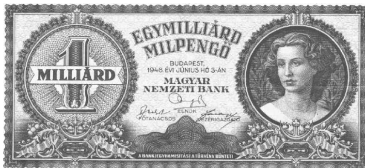
Figure 2.3. Hyperinflation in 1946: a one-billion milpengő bank note from Hungary. One milpengő is already a million pengős, so this note stands for 10^{15} pengős.

a minimum fraction of the customers' deposits in coins or bank notes, or, more conveniently, in a non-interest-bearing account with the central bank. The central bank also agrees to act as lender of last resort , that is, to provide liquidity to private banks in case of a run (see panel 2.3).