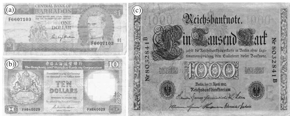
Figure 2.2. Bank notes: echoes from the past. Two new notes and an old one. (a) The Barbados dollar note still reassures the holder that this note is “legal tender for the payment of any amount,” that is, cannot be refused as a means of payment. (b) This particular Hong Kong dollar note is issued by HSBC, a private bank, and still bears the message that the general manager (of HSBC) “promises to pay the bearer on demand at its Office here” the amount of ten dollars (in coins). (c) I will translate the 1910 German note bit by bit: Ein Tausend Mark (one thousand marks) zahlt die Reichsbankhauptkasse in Berlin ohne Legitimationsprüfung dem Einlieferer dieser Banknote (without proof of legitimation) dem Einlieferer dieser Banknote (to the deliverer of this bank note).

private sector, and (iii) claims on the domestic government. Note also that most of the money it created is lent to the economy, not given away. So by refusing to roll over the loans, the bank can shrink the money supply back to the original size. Even the money brought into circulation as a payment for assets bought from the private sector or the government, as in the above foreign exchange example, can be retired: just sell back the asset into the open market and take payment in notes. This mechanism, as we shall see, is still the basis of monetary policy.